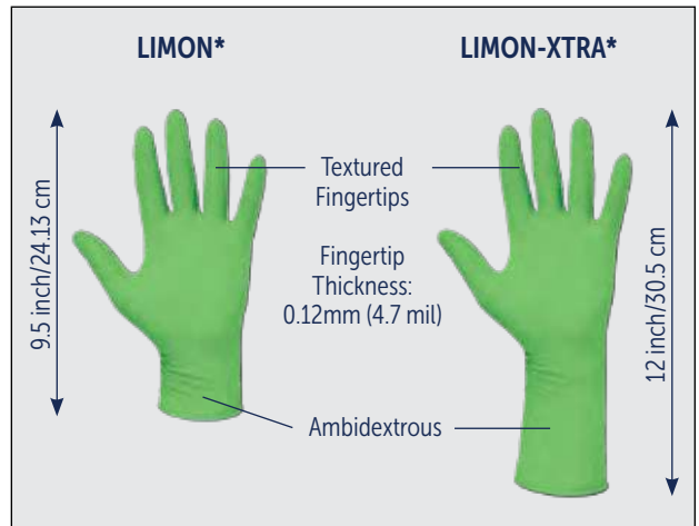
HALYARD* PUREZERO* LIMON* Nitrile Exam Gloves - 9.5"/24cm Length